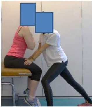
Leg test (14 tasks)